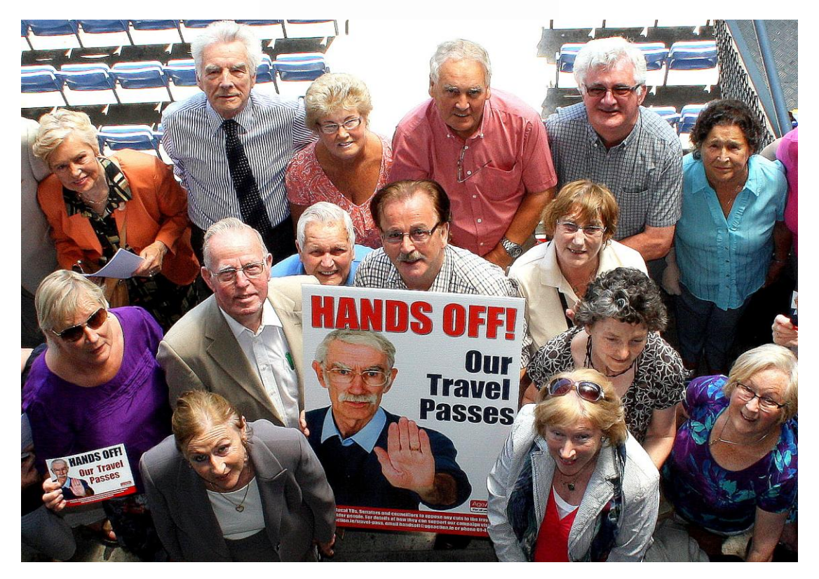
'HANDS OFF OUR TRAVEL PASS'