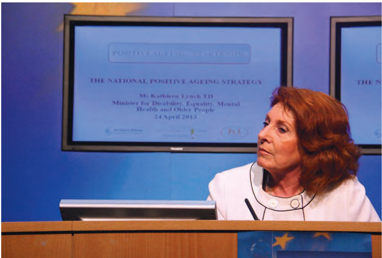
■ Minister for Older People, Kathleen Lynch, at the launch of the National Positive Ageing Strategy. “Our thinking about age and ageing has to change,” she said.