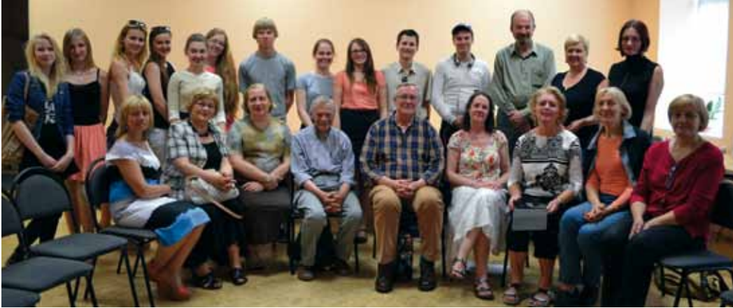
■ The Irish volunteers pictured in Lithuania with a group of young journalists, students, teachers and Lithuanian volunteers.