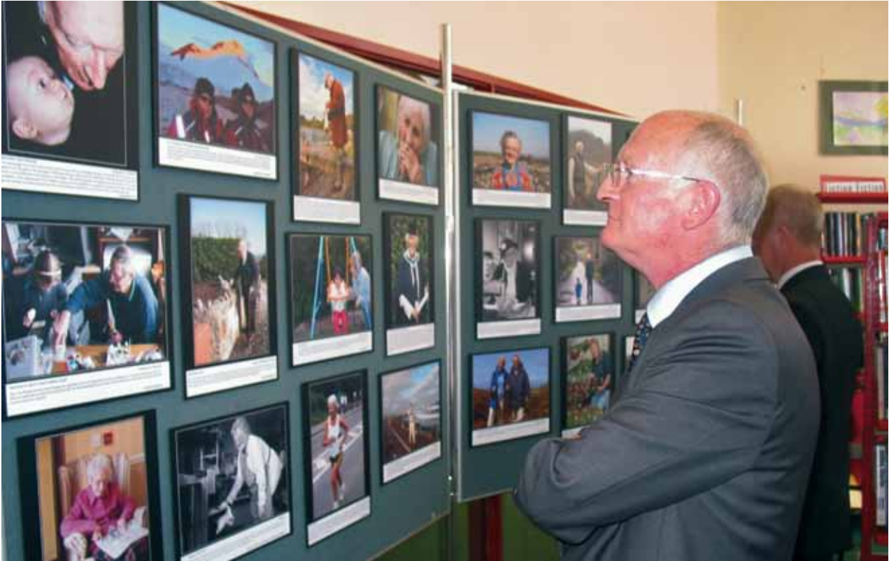
Members of the public in Midleton, Co. Cork enjoy the Positive Ageing Photo Exhibition.