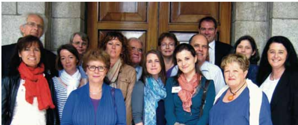
■ Members of the French delegation with Age Action preparing to leave on one of the field visits which were part of their three-day programme in Ireland.