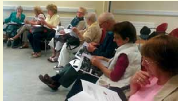
Cork and Dublin Glor groups in their meeting at St Luke's in Mahon, Cork.

Both groups want to lobby politicians on the October Budget.