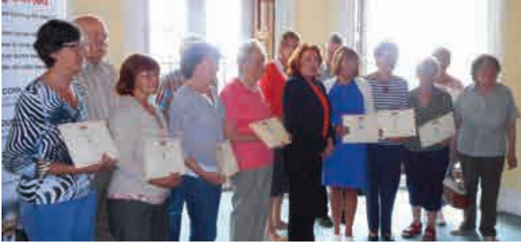
■ Minister of State Kathleen Lynch with participants at the Getting Started summer camp at the Ennismore Retreat Centre in Cork.