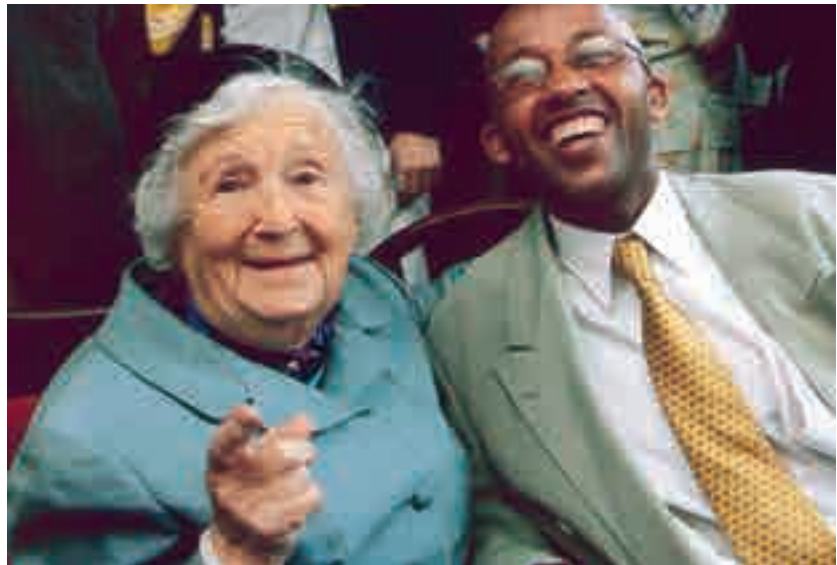
An estimated 30% of staff in the older adult care sector are from another country.

Research by the Migrant Rights Organisation and by the Irish Centre for Social Gerontology in Galway University has shown that the overall picture is positive. However, the research also identified a number of areas that require more-careful attention. Many migrant care workers experience a degree of cultural misunderstanding, discrimination and sometimes explicit