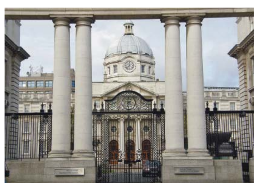
■ Two governments, four political parties and three ministers for older people were involved in the development of the strategy which is still awaiting implementation almost two years after publication.

The demographic forecasts predict Ireland has time to plan and the time to get it right. "But there is no evidence that we are using this time wisely. Our National Positive Ageing Strategy is lying on a shelf. There is no joined up thinking, no understanding that ageing is a cross-departmental