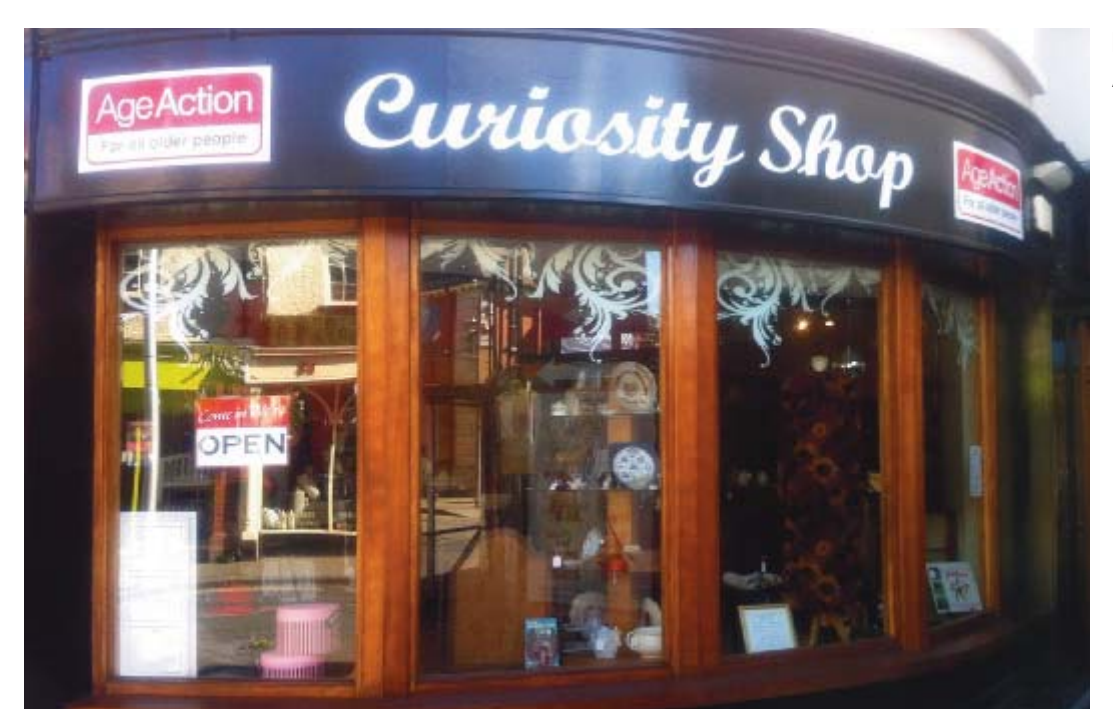
The Age Action Curiosity Shop in Dun Laoghaire