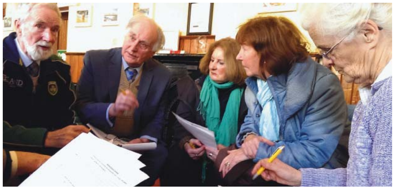
■ Members in deep discussion during a breakout discussion at the Dublin meeting.