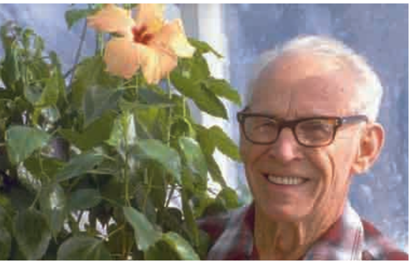
The report urges a HealthStat audit of all community care services for older people.

"The lives of many marginalised older people in Ireland would be significantly improved if the report's eight recommendations were acted on by